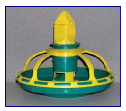
14" standard profile / 5 spoke general purpose grill