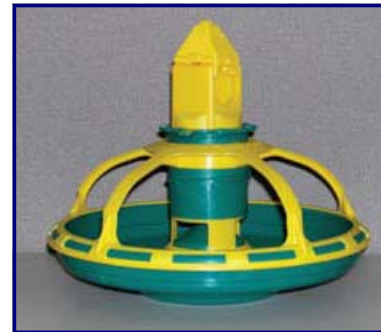
14" standard profile / 5 spoke general purpose grill